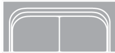
9679-60TA 77½"W x 35"D x 29½"H