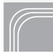
9679-40CS 35"W x 35"D x 29½"H